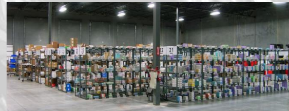
Small Shelf Storage