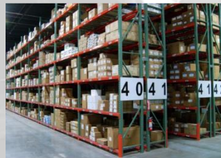
VNA Wire Guided Storage