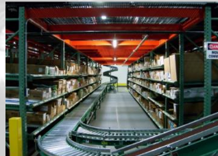
Case Flow Each Pick